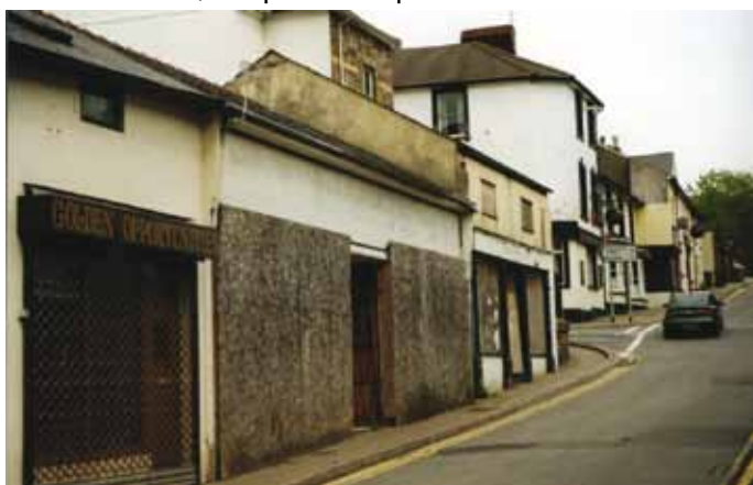
'Plywood City' - many of Blaenavon's shops were boarded up by the 1990s

In 1997 a survey of Blaenavon residents revealed that most local people felt ashamed of the neglected appearance of their town. Over £15 million of public and private money has since been invested into the historic centre of Blaenavon. 75% of the dereliction in Broad Street has been made good; 500 residential and commercial properties have been renovated; car parks and public amenities have been