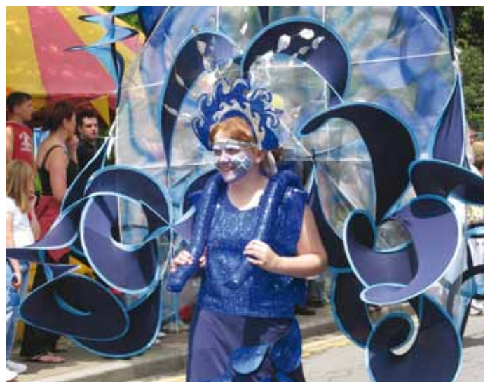
World Heritage Day is the highlight of Blaenavon’s busy calendar of events

Blaenavon has always been a close-knit community, with a wealth of groups and societies. World Heritage Status has helped ensure that these strong bonds continue into the new century. Blaenavon boasts an exciting calendar of events, including World Heritage Day in which community groups and schools always participate. Blaenavon has also become an important place of study, with thousands of schoolchildren, students and researchers learning here each year. Blaenavon offers much to people of all ages and backgrounds, for both locals and visitors alike.