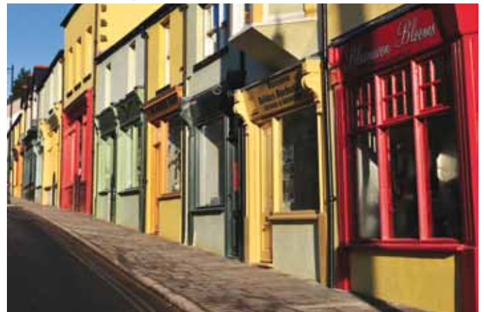
Following an ambitious regeneration programme, Broad Street has an attractive Victorian appearance

Blaenavon has had a major facelift in recent years and is now a town to be proud of; but what of the economic impact of World Heritage Status?